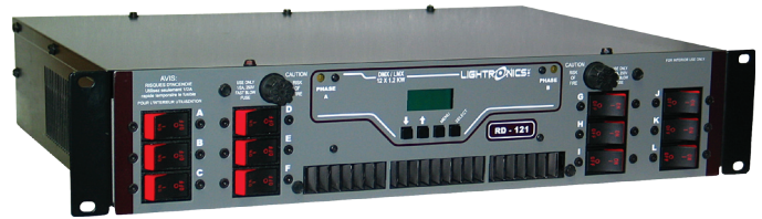
RD121 Rack Mount Dimmer

The RD121 is a 14,400 Watt, 12 channel, rack mount lighting dimmer. It is suitable for church, stage, theater, school, night club, live performances and other event and artistic applications. Each of the channels has a capacity of 1200 Watts. It is controlled via low voltage signals which may be LMX-128 (3 wire multiplex), or USITT DMX- 512. The unit is fan cooled. Channels may be independently assigned from the unit. The unit is over temperature and over voltage protected and has a magnetic circuit breaker for each channel. The RD121 also has several "stand alone functions" which enable it to operate without a control console. These functions include a storable scene which may be activated by an external switch closure, a programmable chaser, and 7 factory set chase patterns.