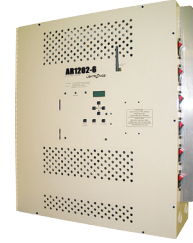
AR1202-6 Wall Mount Dimmer

Flexible, powerful, and affordable, this easy to install and use architectural system is equally at home in churches, schools, theaters, hotels, etc.